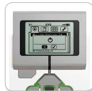
Shut Down screen