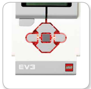
Brick Status Light – Red

You can also program the Brick Status Light to show different colors and to pulse when different conditions are met (learn more about using the Brick Status Light Block in the EV3 Software Help).