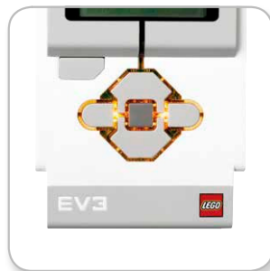
Brick Status Light – Orange