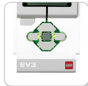
Brick Status Light – Green